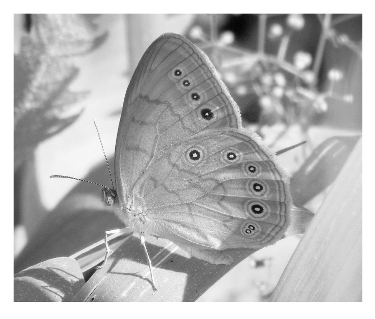
Eyed Brown ( Satyrodes eurydice ), 7/4/18, Shelburne, MA, Bill Benner

Cover photo: Brown Elfin ( Callophrys augustinus ), 5/5/18, Karner Blue Easement, Concord, NH, Nick Dorian