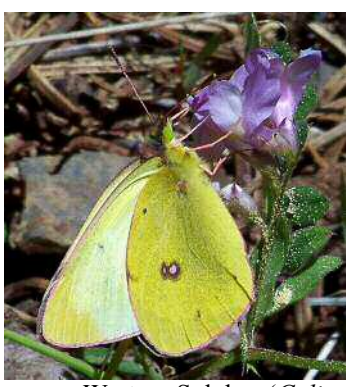
Western Sulphur ( Colias occidentalis), 6/15/18, Ashland, OR, Frank Model