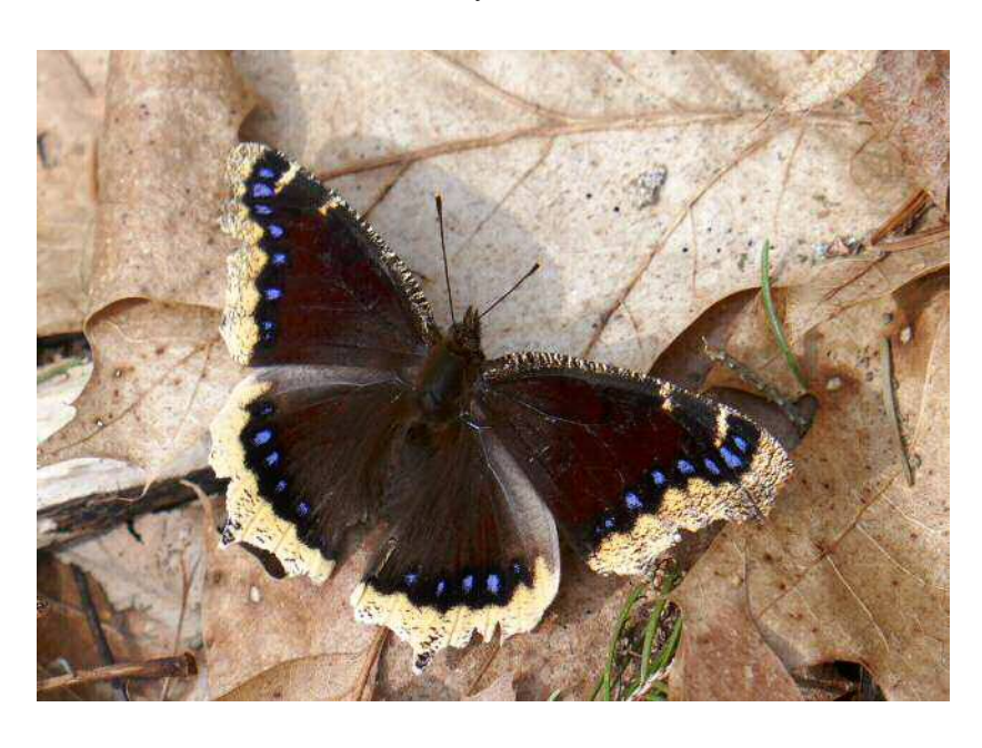
Mourning Cloak ( Nymphalis antiopa), 4/12/18, Lincoln, MA