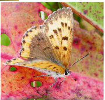
Bronze Copper ( Lycaena hyllus ), 10/9/18, Lincoln, MA, Linda Graetz