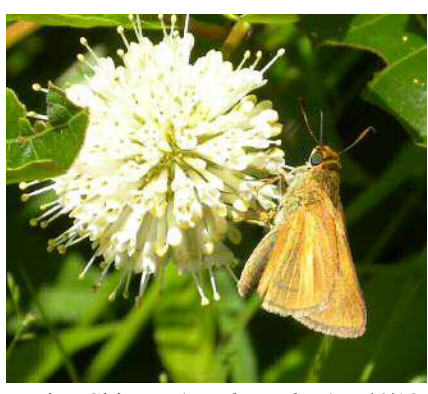
Dion Skipper ( Euphyes dion ), 7/6/18, New Salem, MA, Sue Cloutier