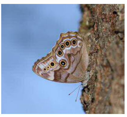
Northern Pearly-Eye ( Enodia anthedon), 7/12/18, Sherborne, MA