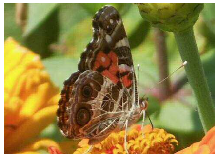
American Lady ( Vanessa virginiensis), 8/26/18, Danvers, MA