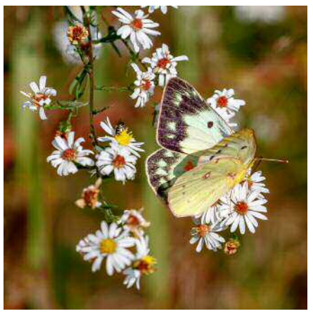
Orange Sulphur (white form female), ( Colias eurytheme ), 10/9/18, Bruce deGraaf