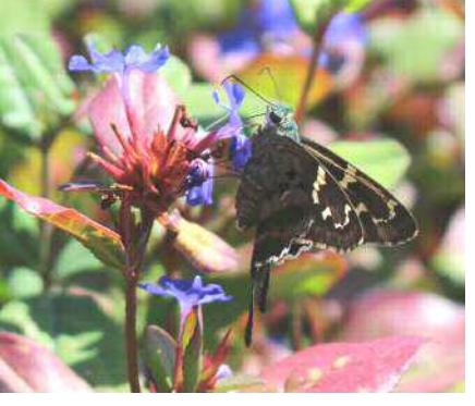
Long-tailed Skipper ( Urbanus proteus), 9/1/18, Sylvan Nurseries, Lauren Miller-Donnelly