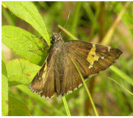
Hoary Edge ( Achalarus lyciades ), 6/20/18, Broad Meadow Brook, Worcester, MA, Sue Cloutier