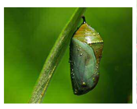
Monarch chrysalis ( Danaus plexippus), 9/19/18, Florence, MA