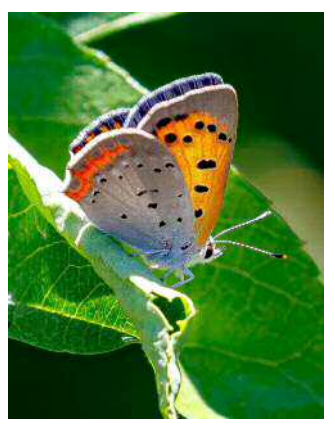
American Copper ( Lycaena phlaeas ), 7/8/18, Shrewsbury, MA, Bruce deGraaf