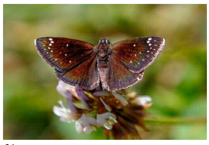
Common Sootywing ( Pholisora catullus), 7/7/18, Shrewsbury, MA, Bruce deGraaf

Gray Hairstreak ( Vanessa virginiensis ), 5/18/18, Karner Blue Easement,