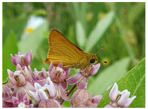
Delaware Skipper ( Anatrytone logan), 7/6/18, New Marlborough, MA