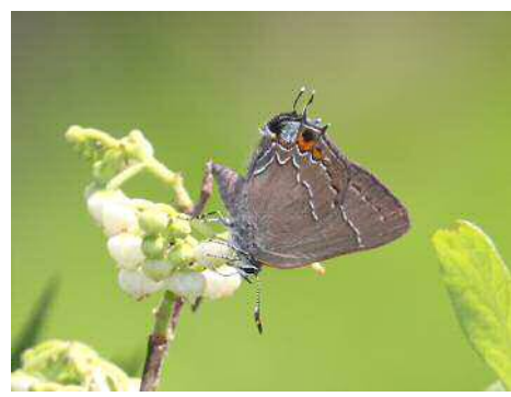
Oak Hairstreak ( Satyrium favonius), 6/17/18, Worcester, MA