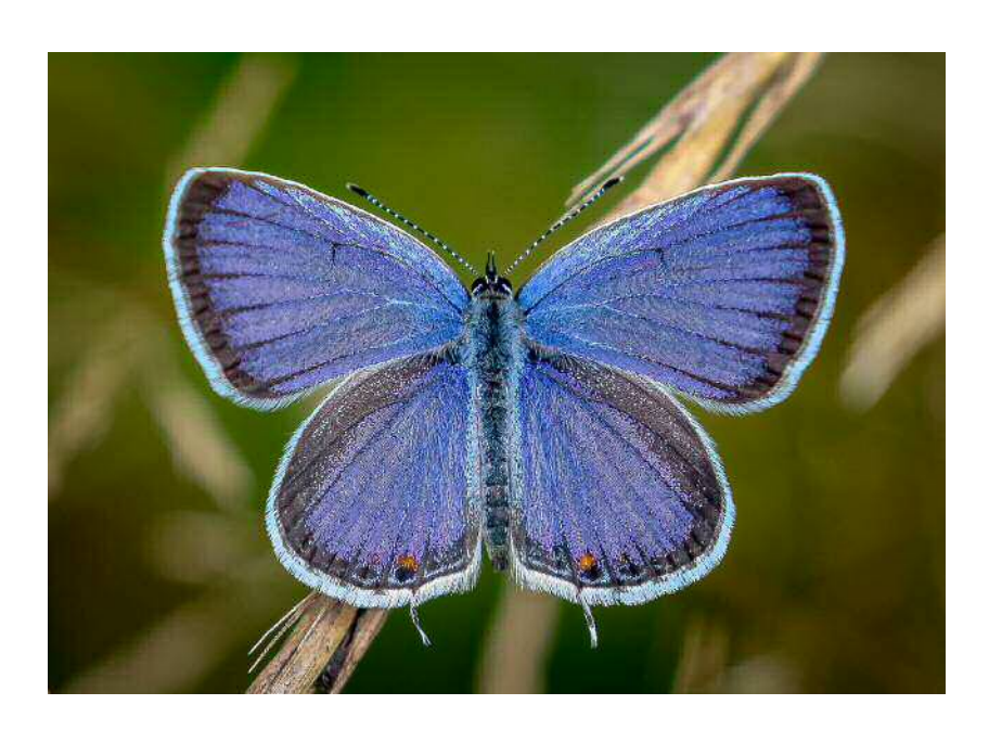
Eastern Tailed-Blue ( Everes comyntas ) 8/31/18, Shrewsbury, MA, Bruce deGraaf