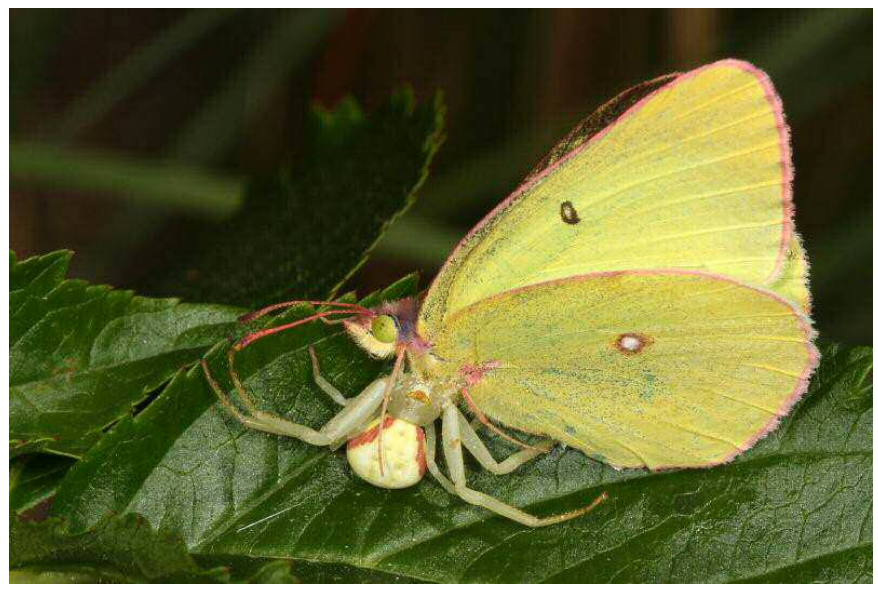
Pink-edged Sulphur ( Colias interior ), and Goldenrod Crab Spider ( Misumena vatia ), 7/16/18, Winter Harbor, ME, Bo Zaremba

I was sitting on a large rock on the edge of a trailhead parking area, watching and photographing a Pink-edged Sulphur. It would land, nectar briefly and fly off, constantly returning to the flowering plant. We had settled into a steady rhythm, nectaring and photographing, when suddenly the butterfly was flying very erratically, flapping furiously but making no progress. At first I thought it had flown into a spider web, but a closer look dispelled that idea. Then I noticed a silk thread from the butterfly to the plant. A crab spider had clamped onto the Sulphur. The Sulphur had flown off with the spider on it, but the spider had tethered itself to the plant by exuding the silk thread. As the venom took effect, the spider slowly reeled itself and its prey back to the plant.